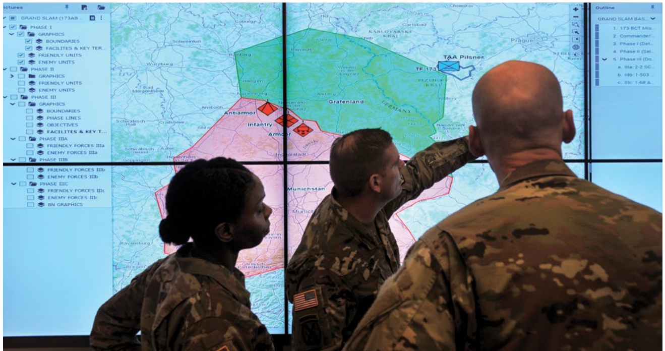
Soldiers demonstrate the Command Post Computing Environment prototype at Aberdeen Proving Ground in May 2017.