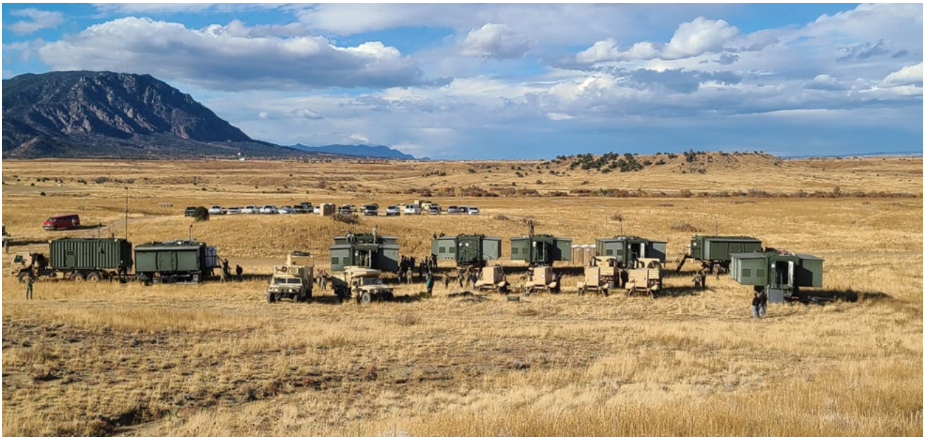
The 4th Infantry Division completes set up of a new division tactical operations center in December 2021 at a Fort Carson, Colorado, training area during the Command Post Infrastructure Integration (CPI2) test. The design of CPI2 enables a division headquarters to be scalable, modular, and agile while reducing the physical area required of tactical operations.

Command posts must demonstrate resilience and persistence in temporary isolation and under austere conditions. This also implies that even highly mobile command posts must be protected in a way that our current expandable vans and tentage are not. They must be armored, and we must develop solutions that deliver scalable capability to units where hardening command posts will be difficult, including our airborne and light expeditionary forces. To this end, we should pursue command post capabilities that are multimodal, with vehicle-mounted capability that can be quickly and easily dismounted to occupy hardened structures and blend into dense urban terrain. Command posts must also be capable of masking their signature to complicate an adversary's targeting by concealing their visual, thermal, electronic, acoustic, and soon, their quantum signatures. 37 Ultimately, if we can reduce the size and structure of command posts at all echelons to a few tactical armored vehicles, the extraordinary signature of our high-tactical and operational command posts will fade into the normalized electromagnetic spectrum and background clutter of a battlefield where armored vehicles are ubiquitous. In this way, we may deny the enemy the ability to discern priority and high-value targets, a valuable skill in an environment that may be characterized at times by a shortage of precision munitions. This approach reinforces the Sun