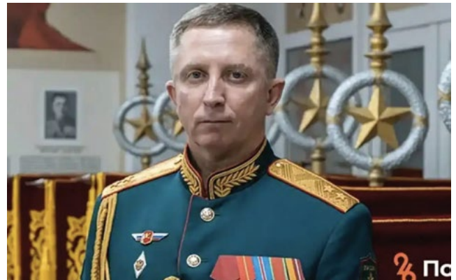
Lt. Gen. Yakov Resantsev, commander of the Russian 49th Army of the Southern Military District, is the highest-ranking Russian officer the Ukrainian military claims to have killed. Ukrainian officials assert he was killed 25 March 2022 as a result of a Ukrainian strike on his command post at the Chornobaivka airfield northwest of the city of Kherson.

In Ukraine, the village of Chornobaivka is legendary. 1 Songs are written about it. 2 Throughout 2022, the small town and its airfield on the outskirts of Kherson were a meatgrinder for Russian forces. From its original occupation in February to its liberation in November, Ukrainian strikes rained down with a precision and lethality rarely seen in war and allowed a scrappy defender to take down a regional leviathan. 3 Patriotic enthusiasm aside, closer inspection of this hard-won victory reveals that lurking beneath the wreckage of Russian ambitions in the Kherson Oblast is a warning about the vulnerability of legacy command posts that the United States and its allies would do well to heed. The story of Chornobaivka is one of relentless assault on command and control characterized by a systematic attack on Russian command posts at scale and across all tactical echelons. 4 Over the span of eight months, the Ukrainian fires strike complex successfully attacked the headquarters of Russia's 8th Combined Arms Army, the 49th Combined Arms Army, the 22nd Army Corps, the 76th Guards Air Assault Division, the 247th Guards Air Assault Regiment, and their subordinate elements over twenty-two separate times. 5 These attacks significantly degraded the Russians' ability to plan and conduct coordinated operations on the western side