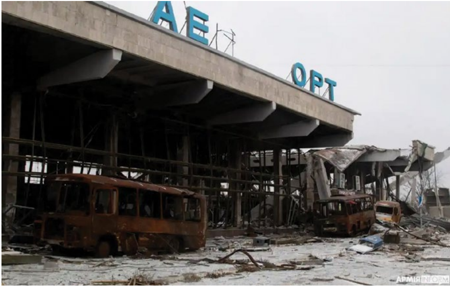
Kherson International Airport, Chornobaivka, Ukraine, is heavily damaged 7 December 2022 after Ukrainian forces destroyed diverse Russian targets there including a Russian command post.

of the Dnieper River. The loss of effective command and control sapped Russian momentum and prevented Russians from consolidating gains, which ultimately led to their expulsion. In the process, Ukraine struck down high-level Russian leadership, killing Lt. Gen. Yakov Resantsev, commander of the 49th Combined Arms Army, and nearly killing Lt. Gen. Andrey Mordichev, commander of the 8th Combined Arms Army. 6