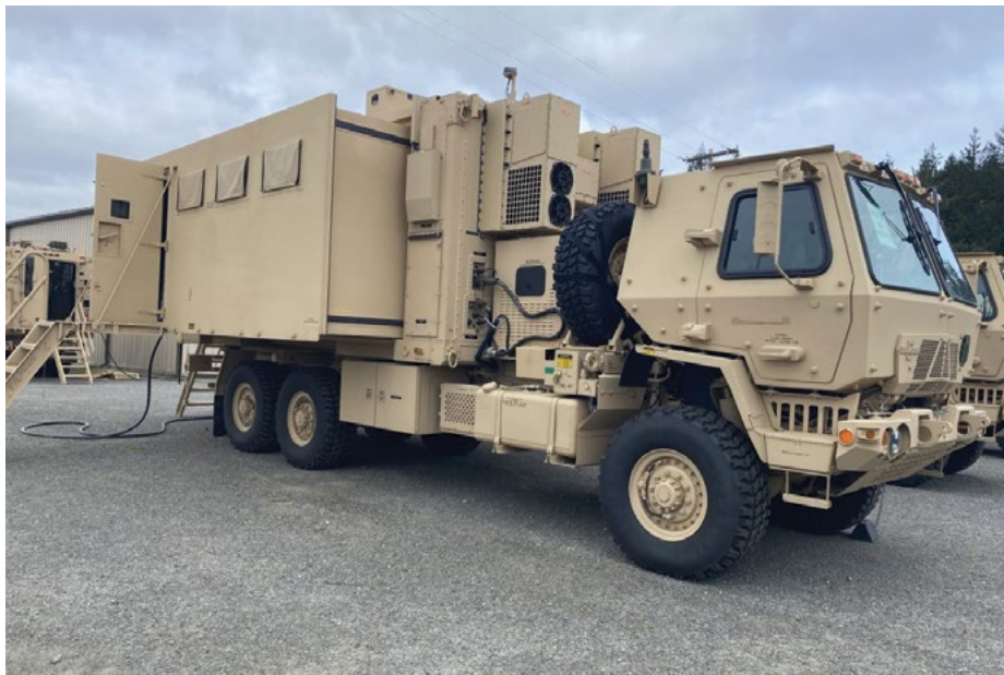
An M1087 Expandable Van Shelter houses the Command Post Integrated Infrastructure System under operational test by the 2nd Infantry Division's 2nd Stryker Brigade Combat Team at Joint Base Lewis-McChord, Washington.

the concerted employment of capabilities from multiple domains and echelons against combinations of decisive points in any domain to create effects against a system, formation, decision maker or in a specific geographic area.” 31 In part, convergence is achieved through combined joint all-domain command and control and therefore must be a driving factor in the composition of future command posts. Convergence reminds us that, far from giving up capability at echelon to simplify our activities, any acceptable command post design must be able to achieve even greater effectiveness through more robust integration and interoperability. Command posts that connect sensors, shooters, and decision-makers enabled by machine learning and artificial intelligence will transform the legacy kill chain into a kill web to create “exploitable opportunities that enable freedom of action and mission accomplishment.” 32 This mandate for data integration positions decision-quality data that enables commander’s processes (e.g., understanding, visualization) at the heart of the modern command post. To retain agility and enable the constant flow of the right data to the right leaders, command posts can no longer rely on legacy stove-piped systems, on-site servers, and the accompanying support mechanisms as the primary means