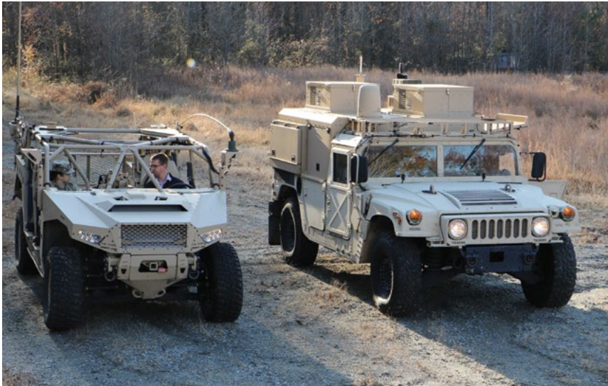
The Department of Defense has selected a mobile power program from Army Futures Command to increase the speed at which on-the-move power capabilities are delivered to the battlefield.

Tzu dictum that “all warfare is based on deception” and applies it to our command posts, thereby setting the tone we hope is reflected in the operations they direct. 38 We must also not forget that survivability, whether physical, informational, or human, is just one aspect of endurance. Endurance also has a sustainment aspect, which implies that whatever command-and-control system is fielded, it must be capable of operations for an indefinite period. In the past, this may have implied a mountain of logistics and personnel to support work–rest–maintenance cycles. In the future, this problem may be overcome by simply transferring mission command to any one of many distributed command-and-control nodes within a constellation of distributed nodes in much the same way industry manages global workflows.