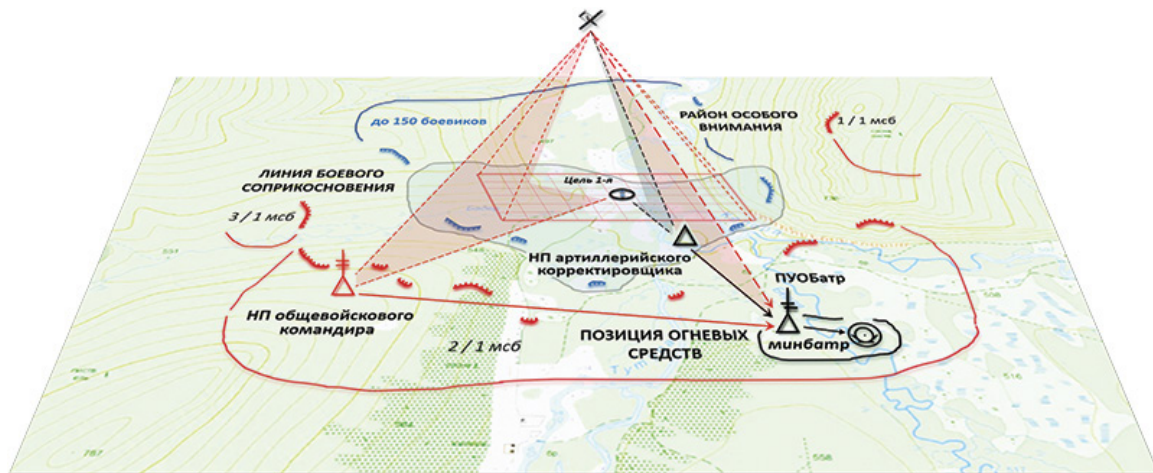
Figure 2: Approximate Scheme of the Management of a Mortar Platoon of the AFRF in the Absence of the Platoon's Command and Observation Post