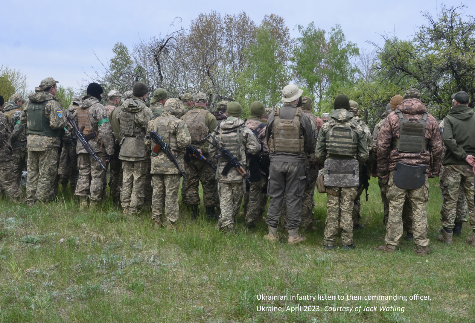
Ukrainian infantry listen to their commanding officer, Ukraine, April 2023.

wasting ammunition, effective tactical command and control of, and between, fire support, engineering and assault units to ensure effective suppression during breaching and assaults without fratricide, and the conduct of assaults themselves. The relevant battle drills are not particularly complex conceptually, but they must be understood well enough by all involved for there to be no requirement to submit a planning process beforehand, or for that planning and delivery of orders to be quick and concise so as to minimise vulnerable pauses in operational activity. They require thorough practice under realistic conditions to build sufficient coordination to be effective, and for there to be the speed and momentum to prevent the enemy from responding effectively.