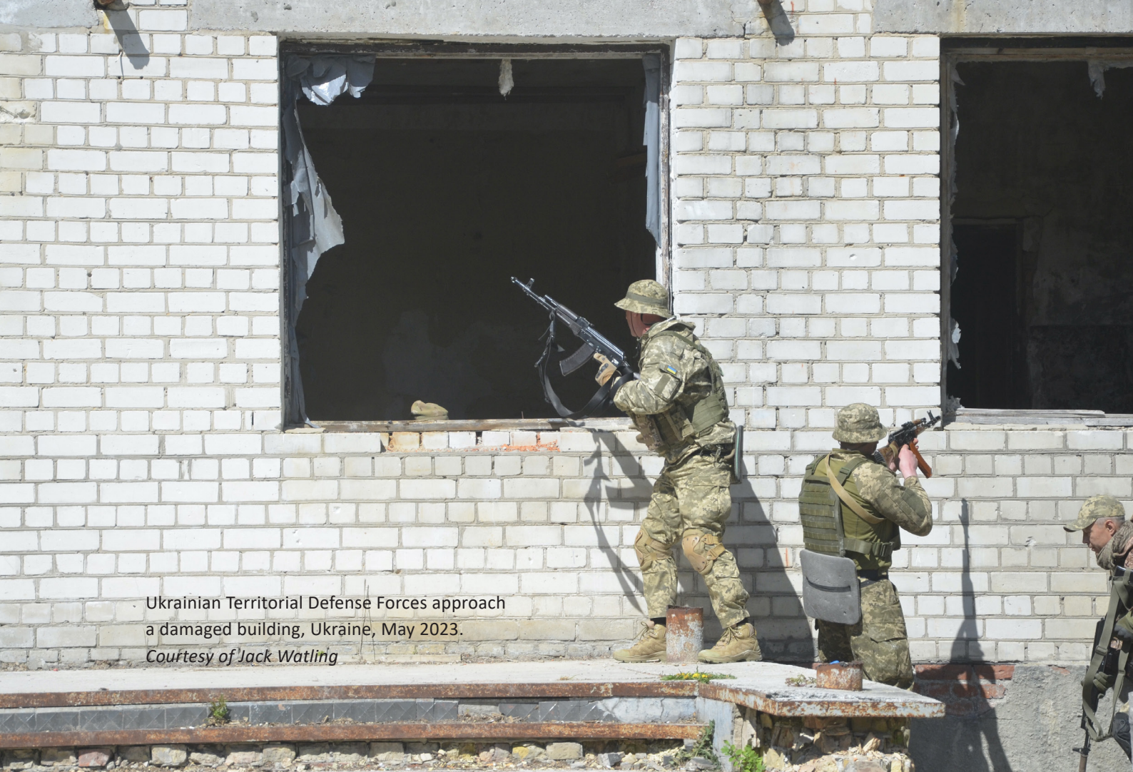
Ukrainian Territorial Defense Forces approach a damaged building, Ukraine, May 2023.

they also risk coming into direct contact with enemy armour, with armoured clashes sometimes taking place from distances as close as 50 m. 48