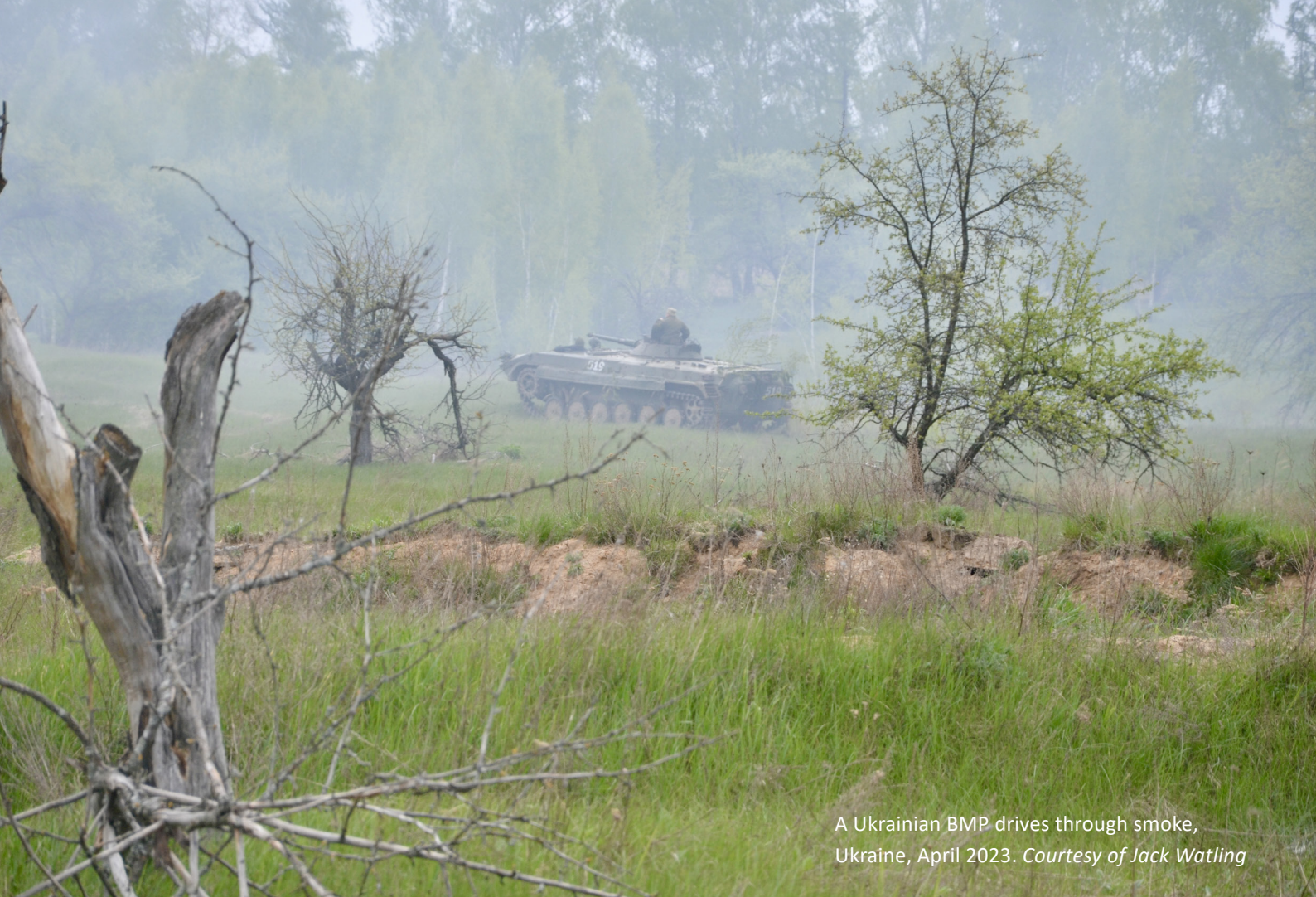
A Ukrainian BMP drives through smoke, Ukraine, April 2023.

updated manuals detailing how these should be structured and employed. In some ways the guidance provided is reflected in Russian offensive operations. The digging of forward positions in preparation for attacks, the use of artillery, the way that armoured vehicles are used separately for stand-off fire support, the use of specialist enabling teams, and the division of infantry platoons into three-to-five-man fire-teams, are all in evidence, although with great variation from the strict doctrinal task organisation provided. Furthermore, probably because to do so would be politically untenable, the doctrine makes no distinction between the specially trained assault infantry teams that form the backbone of assault detachments and their disposable counterparts. The divergence between doctrine and observed practice likely owes much to the inability of the AFRF to either train according to the doctrine or implement it effectively and consistently. 18