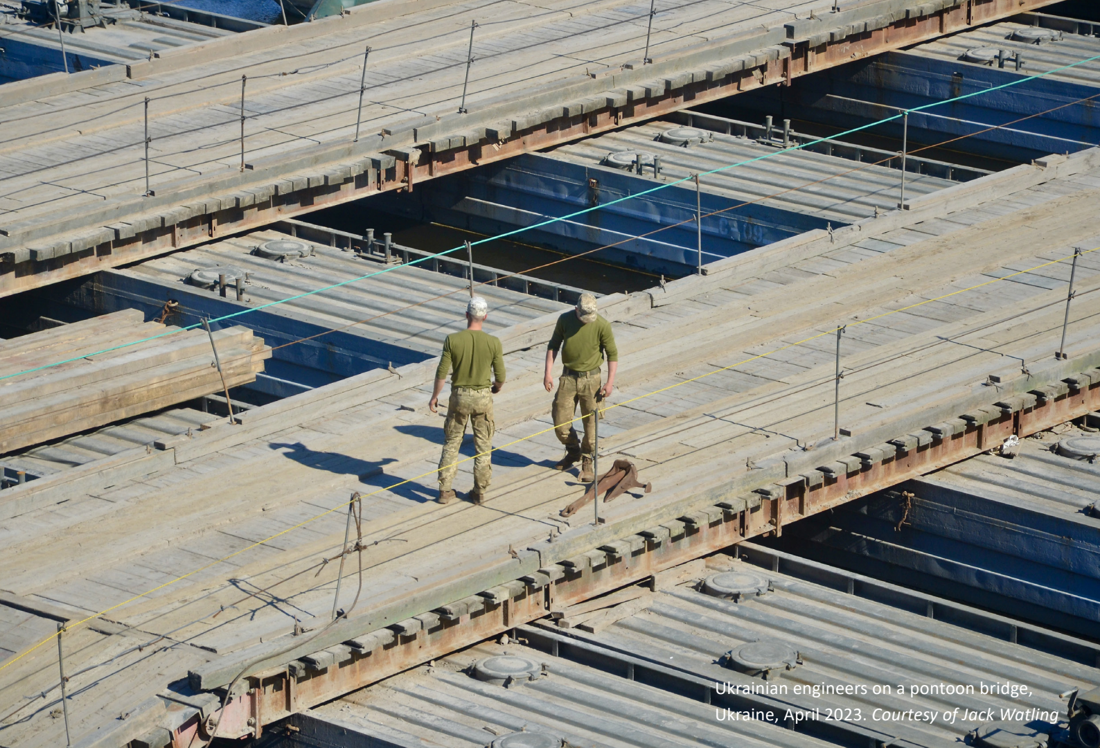
Ukrainian engineers on a pontoon bridge, Ukraine, April 2023.

second defence lines. There is also a strong preference for mining the approaches to natural choke points. In some cases, an AP mine may be placed directly on top of the AT mine. Initiation mechanisms are also often mixed. It is common for AP mines, for example, to be initiated by a seismic sensor and to have an immediately adjacent mine initiated by wires, which are laid out in a cross from the device. The Russians have also made extensive use of magnetically activated AT mines delivered via multiple launch rocket systems (MLRS). Although Russian forces have been successful in tracking the routes through their own minefields, they have performed less well in breaching mine belts laid by the AFU. 28