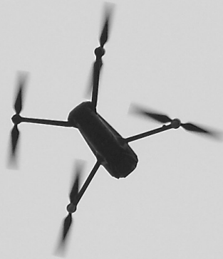
A platoon UAV hovers in overwatch above a defensive position, Ukraine, April 2023.

to each platoon within Russian line infantry units. Another EW function in the counter-UAS fight is deception measures that generate a large number of fake UAVs on enemy systems and replicate ground control stations. While the Russian military is yet to widely exploit the creation of a large number of false targets, it has the capability to do so – and these actions are growing more prevalent.